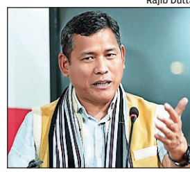
Arunachal minister Ojing Tasing

Dibrugarh: Arunachal Pradesh rural development and panchayati raj minister Ojing Tasing on Friday said nearly 70 per cent of the population supports the Siang Upper Multipurpose Project (SUMP), despite facing fierce opposition from protesters just days earlier. The 11,000MW hydropower initiative in Siang district has emerged as a strategic response to China's dam constructions upstream on the Yarlung Tsangpo river, which becomes the Siang as it enters Indian territory. Beyond water security, the SUMP is projected to gener-