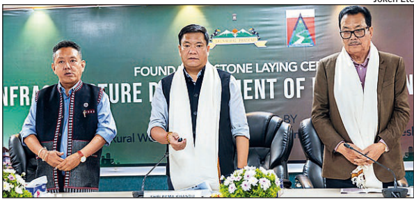
Arunachal CM Pema Khandu (centre), his deputy Chowna Mein and education minister PD Sona at the foundation laying ceremony

Itanagar: Arunachal Pradesh CM Pema Khandu on Friday digitally laid the foundation for various infrastructure development projects across the state worth Rs 750 crores under the education department to be executed by rural works department (RWD) in FY 2025-26. A major part of this effort involves the implementation of multiple education infrastructure projects, including upgrading 39 govt higher secondary schools under the SASCI scheme with a budget